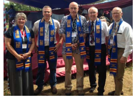
The 'Western' Team