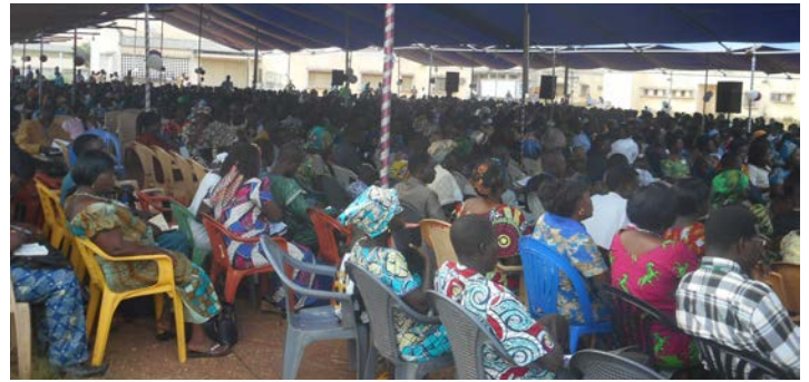
1st Annual Parents Conference